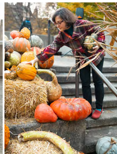
As the photos show, the Pumpkin Smash—an awareness-raising activity—has become a highlight of the fall season at Lehman College.

Pumpkin Smash is a fun-filled annual event developed in collaboration with the New York City Compost Project and hosted by Lehman College since 2014. Its purpose is to raise awareness of, and participation in, environmental sustainability.