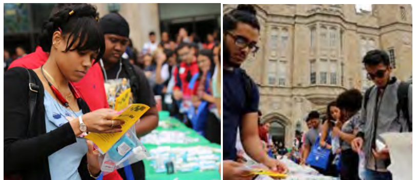
At the Fall student orientation, freshmen assembly toiletries kits for homeless shelters.