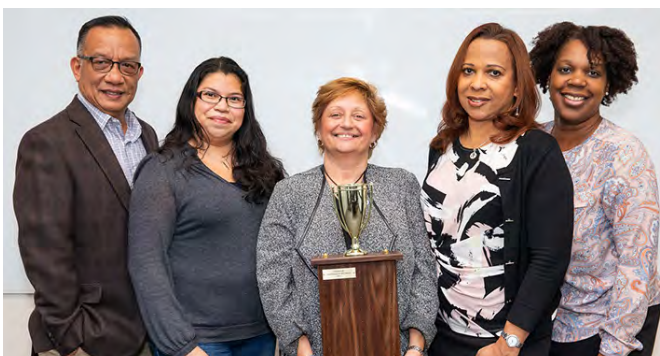
Members of the VP's winning A&F team.