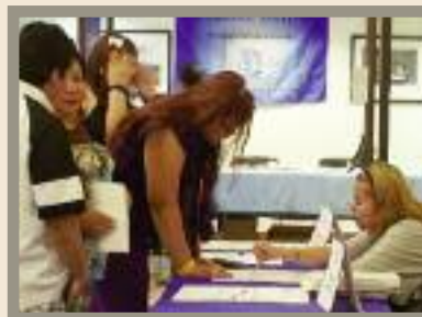
GEAR UP Project Associates with students and their parents at the moment of registration

www.ed.gov/parents Click on "Parents School Box" to access "Challenging High School for All."