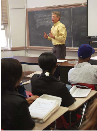
FALL 2015 – Departments with the most professors