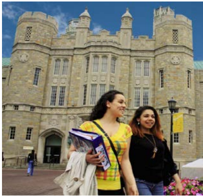
2012-2013 Student Financial Aid Awards