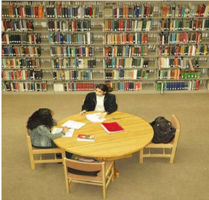
Library Collections (Two Year Comparison)