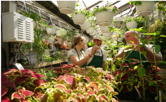
2014-2015 Grants & Contracts