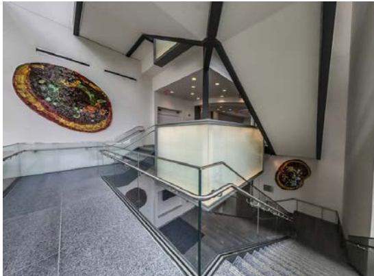
2014-2015 # Annual Budget