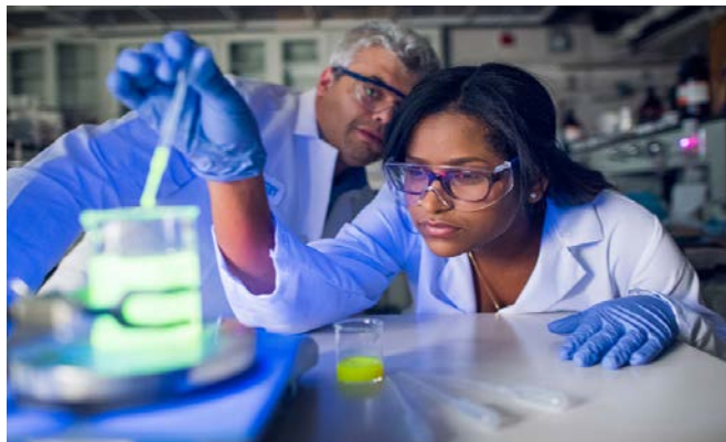
2015-2016 Grants & Contracts