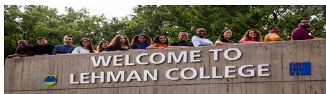
Undergraduate Students Receiving Financial Aid 2016-17