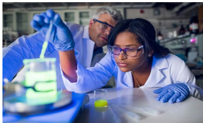
2015-2016 Grants & Contracts