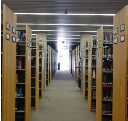
Library Collections (Two Year Comparison)