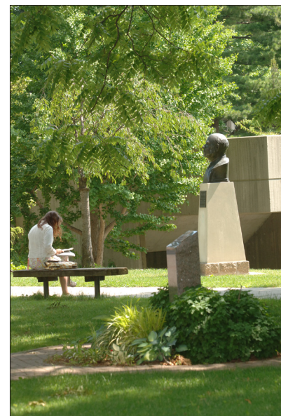
The portrait bust of Herbert H. Lehman keeps a student company during a quiet study break.