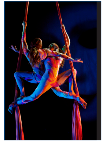
Cirque Athens will perform at the PAC on April 19. View the complete schedule of events at www.lehmancenter.org .