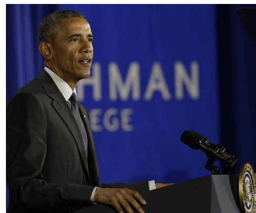
On May 4th, President Barack Obama spoke at Lehman College about empowering young men of color.