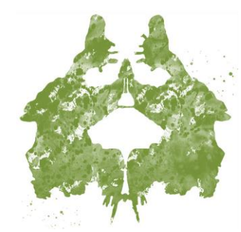
What do you see in this image?

Psychology applies scientific methods to understand how people think, feel, and behave. As a Psychology major, you will learn not only what we know about people, but also how we came to know it. For example, you may learn that psychologists use ambiguous images like the one above to understand how people's feeling influence what they see in the world around them (two people holding hands or a frightening face).