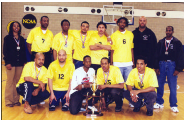
IN ONLY THE SCHOOL'S THIRD VARSITY SEASON, MEDGAR EVERS CELEBRATED A RUNNER-UP FINISH AT THE 2003 CUNYAC CHAMPIONSHIPS