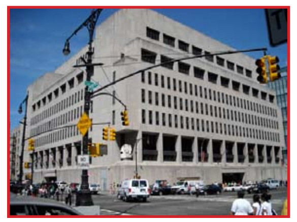
Bronx Family-Criminal Courthouse

windows that borrow daylight from the waiting area corridors.