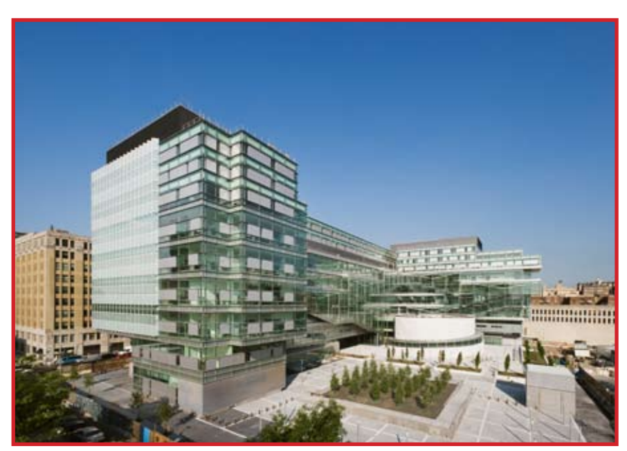
Courtyard, image © Rafael Viñoly Architects

make a decision on your case? Do we have a right to a fair trial? What can this list of rights and responsibilities tell us about our values as Americans? Do all people have the same rights and responsibilities?