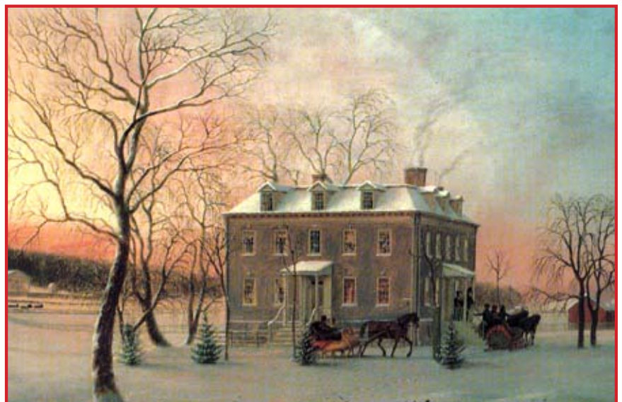
1844 oil painting by George Harvey