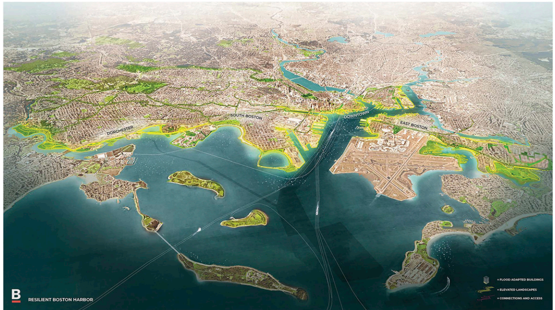
Fig. 2. Green strategies along Boston's shoreline aim to increase access and open space along the waterfront while better protecting the city during a major flooding event.

Yet, recent research suggests that green infrastructure planning for climate change is rooted in a green and resilient city orthodoxy (16, 17) that integrates nature-driven solutions into urban sustainability policy. This orthodoxy, as we have argued in previous research, either overlooks or minimizes negative impacts for socially vulnerable residents while selling a new urban brand of green and environmentally resilient 21st-century city to investors, real estate developers, and new sustainability-class residents (7, 18).