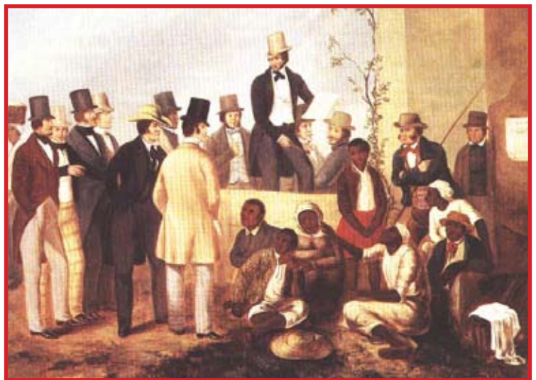
1852 oil painting depicting the scene of a slave market