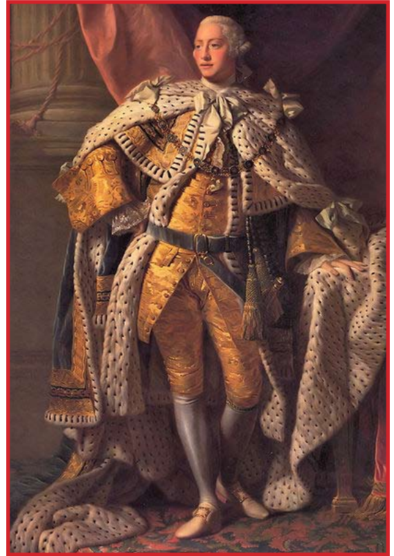
King George III in coronation robes