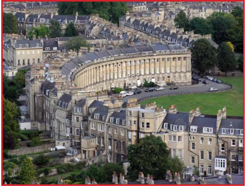
Royal Crescent, Bath, England