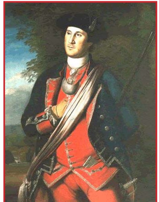
Earliest portrait of Washington, painted in 1772 by Charles Willson Peale, shows Washington in uniform as colonel of the Virginia Regiment